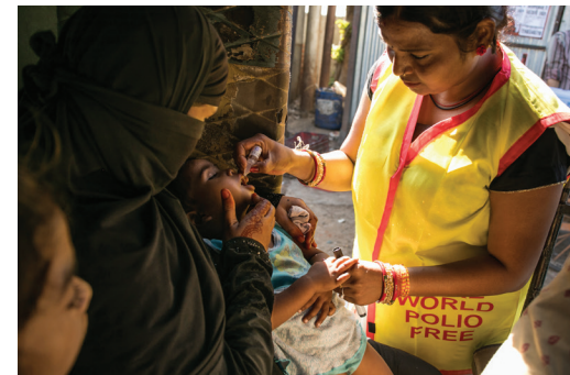
A Rotarian administers the polio vaccine.

Our members’ and others’ contributions to the Foundation allow us to bring sustainable change to communities in need. Ask your club’s Rotary Foundation expert or visit rotary.org/donate to learn how you can support our Foundation. To learn more, download The Rotary Foundation Reference Guide or take the Rotary Foundation Basics course in Rotary’s Learning Center .