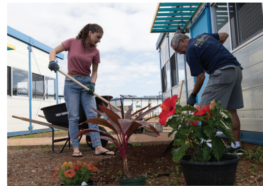
Rotary members and members of the community come together to serve.

A Rotary Community Corps (RCC) is a Rotary club-sponsored group of nonmembers who want to help their own community through service projects. Rotarians provide professional expertise, guidance, encouragement, organizational structure, and some material assistance to the RCC, whose members contribute their labor and knowledge of community needs. This community-based service program was initiated in 1986 to improve the quality of life in villages, neighborhoods, and other communities.