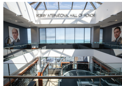
The Arch Klumph Society Gallery from the 18th floor of Rotary International World Headquarters

Club and District Support (CDS) representatives provide regionalized expertise to the clubs and districts they work with and guidance on Rotary's policies, procedures, resources, and tools. They often attend club and district meetings to meet with and train local Rotary leaders. Find your club's CDS representative at rotary.org/cds . You can also contact Rotary's Support Center at +1-847-866-3000 or rotarysupportcenter@rotary.org to ask questions about Rotary and its programs.