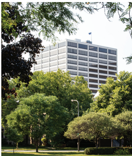
Rotary International World Headquarters in Evanston, Illinois, USA

Rotary International is administered by the Secretariat, which comprises more than 800 employees. Rotary's world headquarters is in Evanston, Illinois, USA, in a building called One Rotary Center. It has a 190-seat auditorium, Rotary's archives, and an executive suite with conference rooms for the RI Board of Directors and Rotary Foundation Trustees and the offices of the RI president and other senior officers. It also features a replica of Room 711, the site of the first Rotary club meeting.