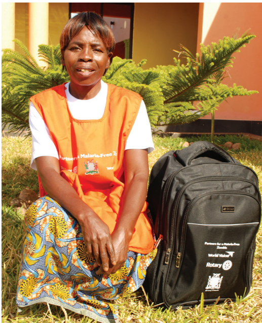
One of the women trained to be a public health worker in Zambia supported by the first Programs of Scale grant

Programs of Scale grants build on the scope, impact, and sustainability of successful Rotary service projects in our areas of focus. They empower Rotary members to work with experienced partners to implement large-scale, high-impact programs that address a critical need for large numbers of people across a significant geographic area. The Rotary Foundation awards one $2 million Programs of Scale grant each year to expand a member-led program over three to five years to create lasting change. Strong monitoring and evaluation systems measure impact, and the knowledge that is gained is shared with other clubs and districts to strengthen their local and international service. Visit rotary.org/programsofscale .