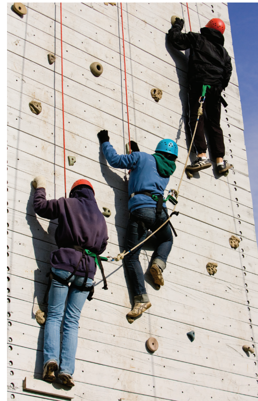
RYLA events instill values of service and leadership.

Each year, thousands of young people are selected to attend club-, district-, or multidistrict-sponsored leadership camps or seminars through Rotary Youth Leadership Awards (RYLA). In an informal atmosphere, participants spend several days in a challenging program of leadership training, facilitated discussions, inspirational addresses, and social activities designed to enhance their personal development, leadership skills, and good citizenship. Each RYLA program or event is customized to the participants' age range.