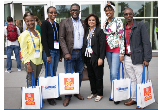
Attendees at the Rotary International Convention in 2019

The first Rotary Convention was held in Chicago, Illinois, USA, in August 1910.